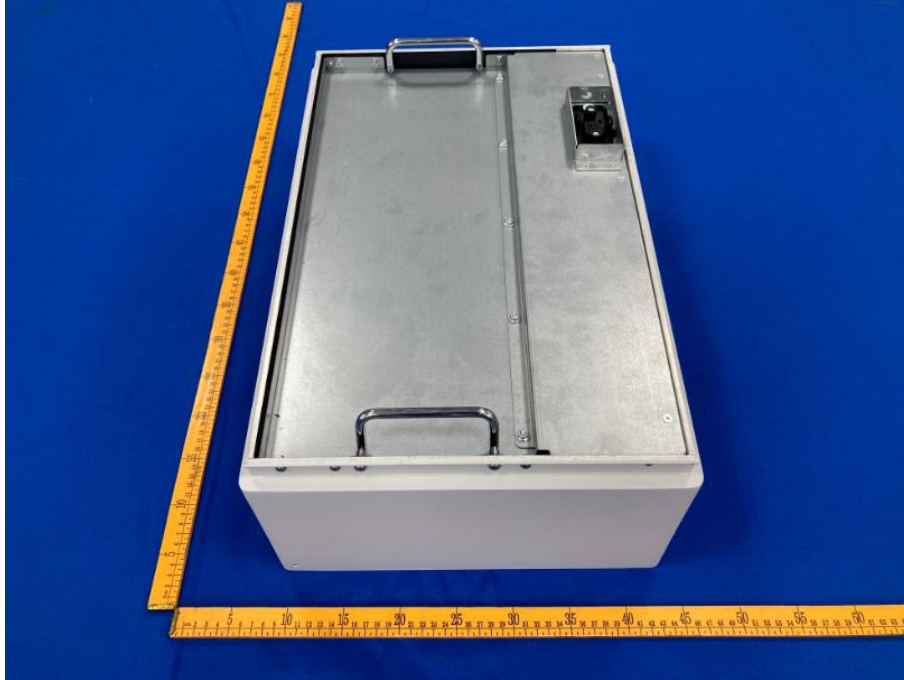
样品图片 (Sample photograph) -4