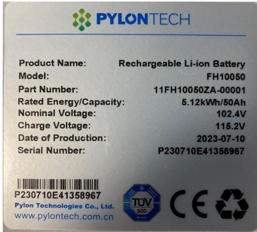
样品图片 (Sample photograph) -8