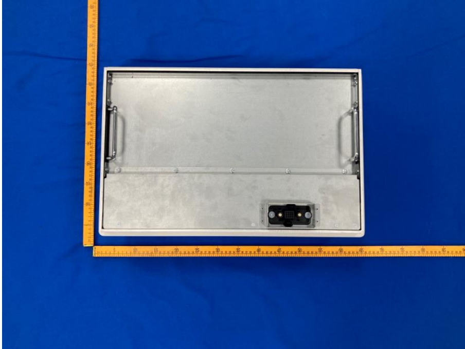
样品图片 (Sample photograph) -2