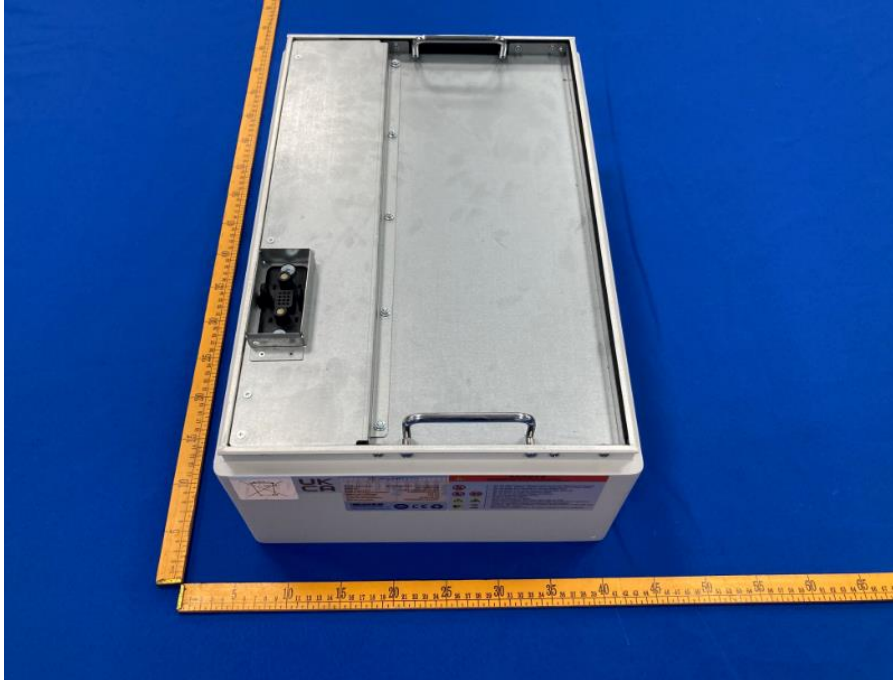
样品图片 (Sample photograph) -6